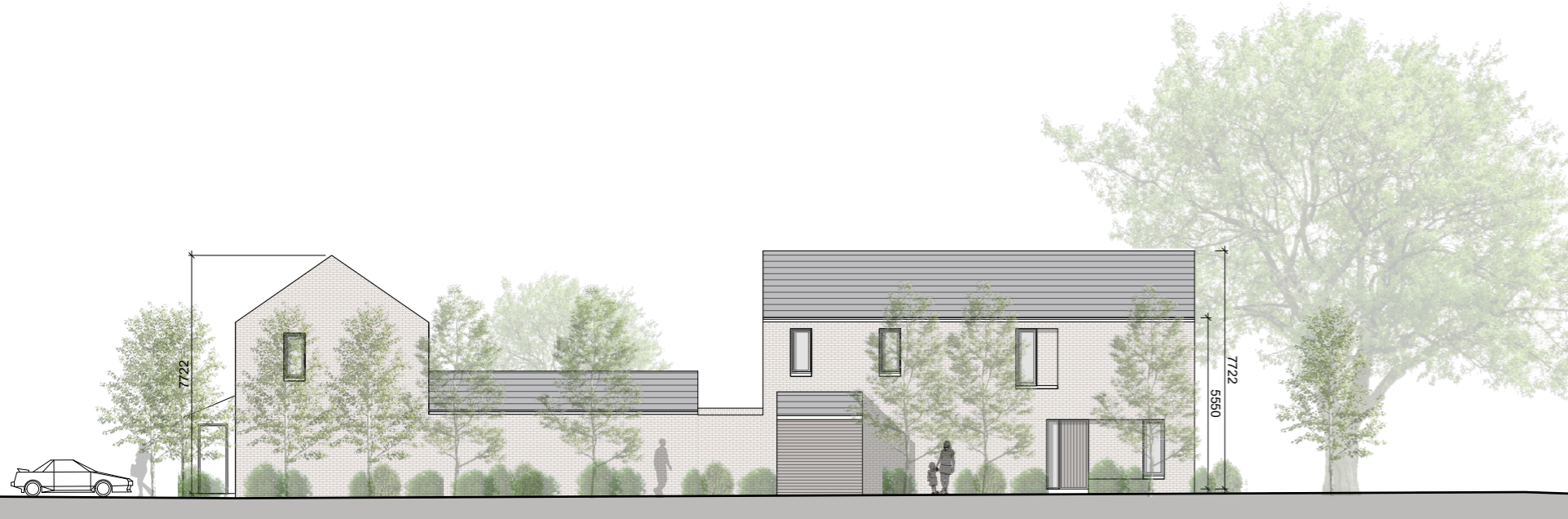
NORTH ELEVATION SCALE: 1:200

CONROY CROWE KELLY ARCHITECTS 65 MERRION SQUARE DUBLIN 2 PHONE 6613990/1 FAX 6765715 e-mail info@cck.ie