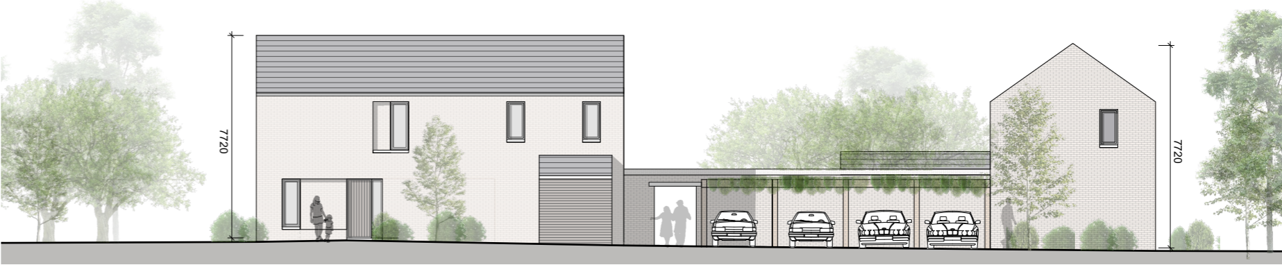
SOUTH ELEVATION SCALE: 1:200