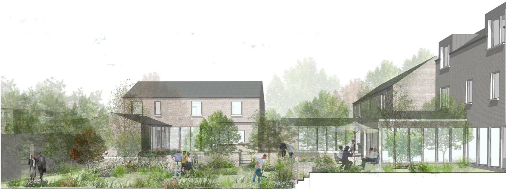
RENDERED PERSPECTIVE SECTION DEMONSTRATING THE CHARACTER OF THE COURTYARD CLUSTER NOTE: NOT TO SCALE