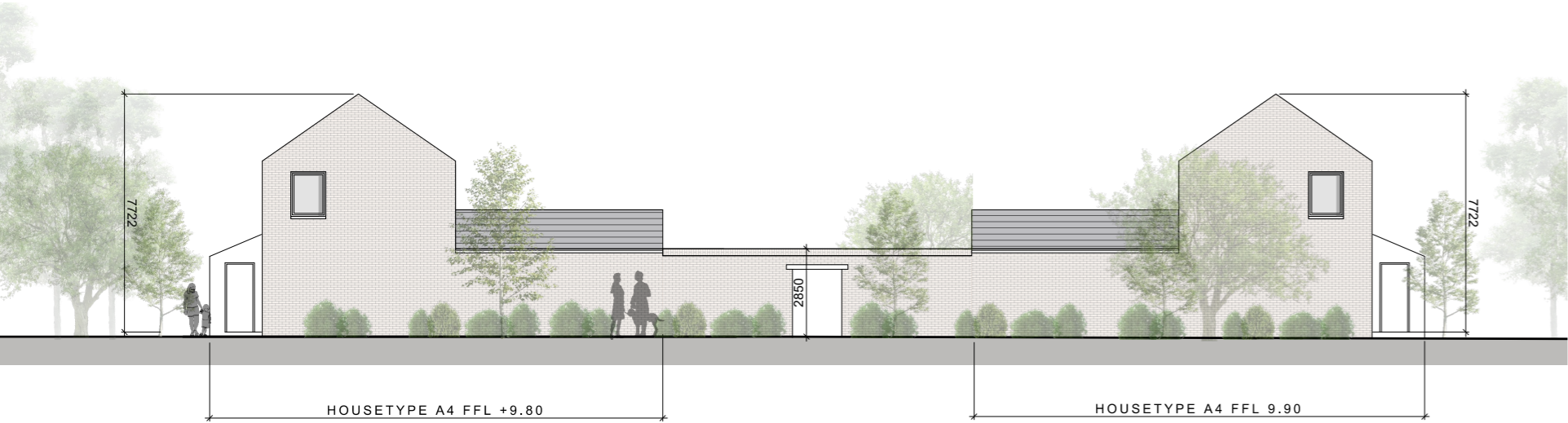
WEST ELEVATION SCALE: 1:200