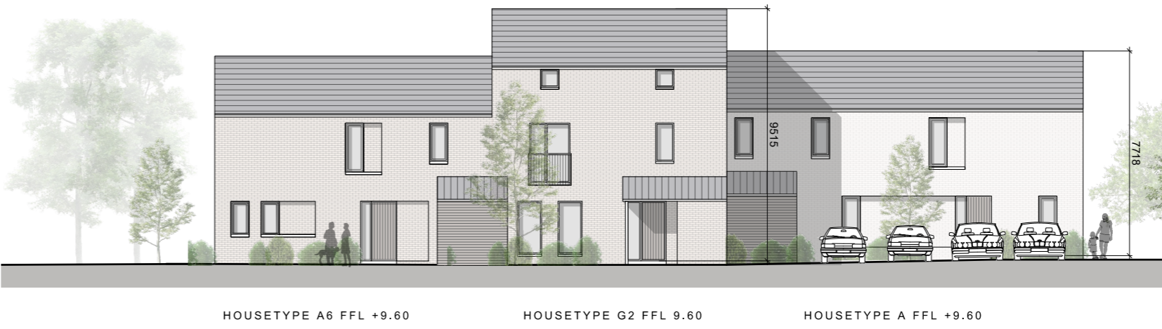
EAST ELEVATION SCALE: 1:200